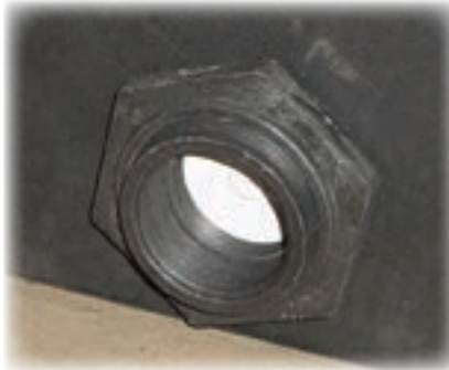
Photo shows bulkhead fitting and plug installed in the end of the spillway.

Once you have sculpted the reservoir, stream and waterfall area carefully check for any rocks, roots or sharp objects in the soil. After ensuring the area is free from objects you can install the underlayment thru the reservoir and stream area. After installing the underlayment you can install the liner as well. Do not be concerned with a few wrinkles in the liner since the whole area will be filled in with rock and covered. Be sure to pull any extra liner towards the waterfall area.