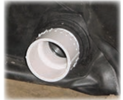
Bulkhead is thru liner, washer and nut are tightened and PVC adapter is installed.

Apply a small amount of silicone to the threads of the pvc male adapter and install the fitting into the outside of the bulkhead.