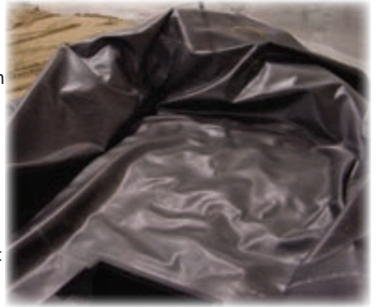
The liner covers the stream bed and goes thru the area where the spillway will set.

If your spillway came assembled, remove the plastic grating from the top of the spillway. There are openings on both ends of the spillway for water to enter. You will need to decide which end is more convenient for your application. First you need to plug the opening you will not be using. Install the bulkhead fitting with the body and the rubber gasket on the inside of the tub. Tighten the plastic washer and the nut from the outside. Install pvc plug on the inside of the tub and tighten. If you are using a large spillway often times water will come in from both ends in which case you would not use the plug but rather install a pvc male adapter on the outside of the bulkhead.