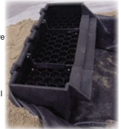
The liner goes under the spillway and wraps up the back and ends.

The spillway can be covered in rock to help hide it from view. Place 3" to 6" rocks on the plastic grating as desired to camouflage all plastic from view. This will help your installation look much more natural.