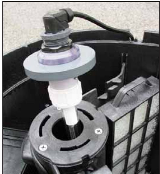
16-watt Retro-Fit UV Sterilizer

6.1 Quartz Sleeve Cleaning: To clean the quartz sleeve, unplug the unit and remove it from the filter. Using a soft, damp cloth, remove unwanted algae and dirt from the outside of the sleeve. Use vinegar or muratic acid to remove calcium deposits (Use extra caution when handling acids and strong cleaning solutions as they can cause bodily harm). A mild dish soap may also be used to clean the quartz sleeve. Make sure to thoroughly remove all cleaning solutions from the quartz sleeve before reinstalling the UV into the filter.