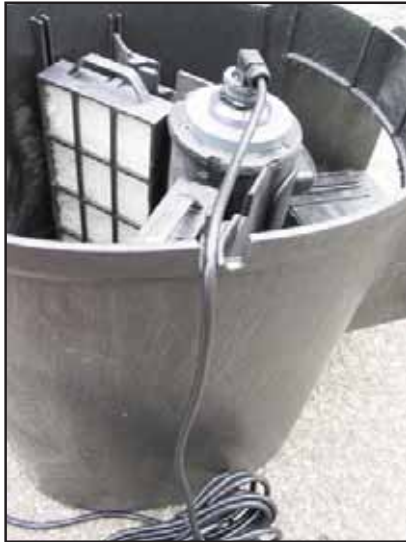
16 Watt UV

5.8a (16-watt) Drape the power cord over and out of the filter as shown to the left. Make sure the cord is resting within one of the notches as shown on the left, to ensure the cord will not interfere with the filter lid. Under no circumstances should the power supply be submerged under water.