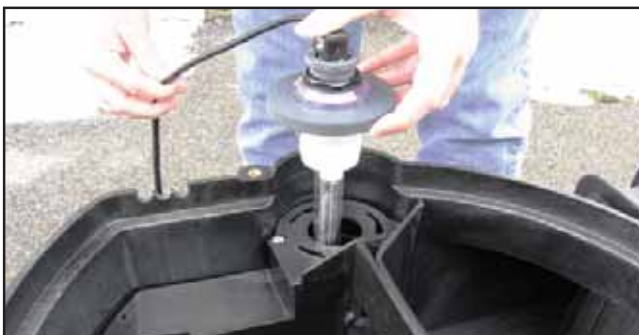
25 & 57-watt Retro-Fit UV Sterilizer