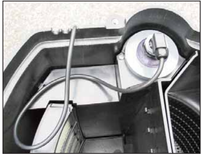
25 & 57 Watt UV

5.8 Drape the power cord over and out of the filter as shown at the right. Allow a fair amount of slack to ensure the cord will not interfere with the lid. Under no circumstances should the power supply be submerged under water.